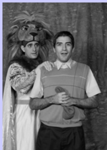
The Lion, the Witch & the Wardrobe presented by Performing Arts October 7